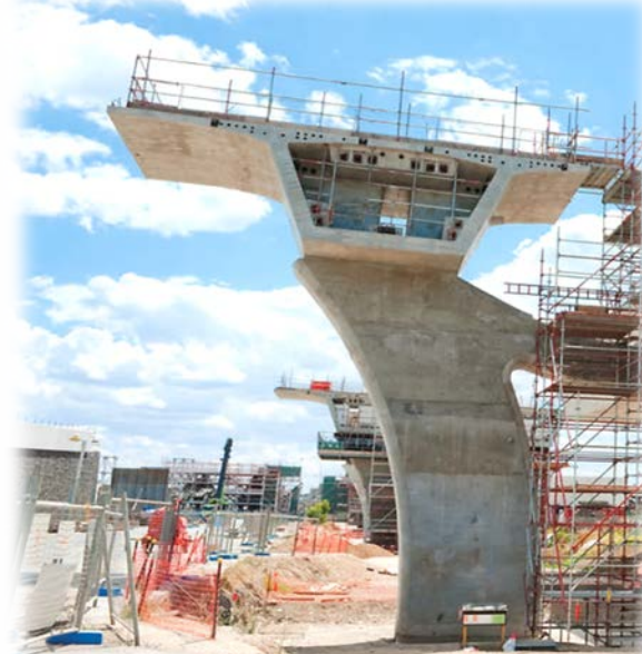
NW 25 Street Viaduct Construction