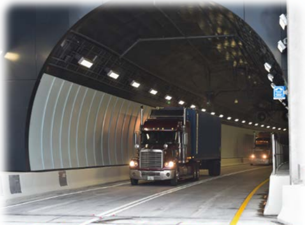
Trucks Exiting Port of Miami Tunnel