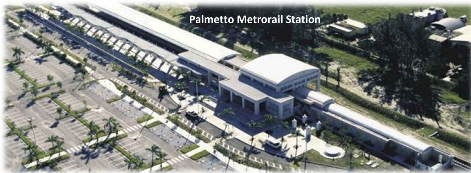
Palmetto Metrorail Station